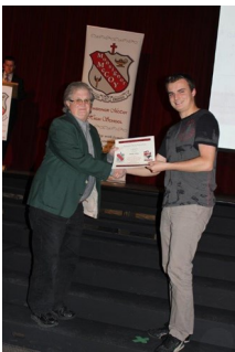
Monsignor McCoy High School Award's Night Recipient of the Stan Gill Memorial Scholarship 2015 - 2016