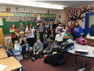
St. Mary's School - Service Projects ($600.00) - Students participated in activities to put others first by nurturing home, school and parish community relationships.

St. Louis School - Snack Attack/Breakfast Program ($1,500.00) - Funds received from a donor were requested to be specifically allocated to the Snack Attack/ Breakfast Program.